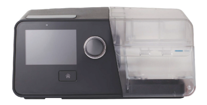
Luna G3 CPAP (LG3500) and APAP (LG3600)