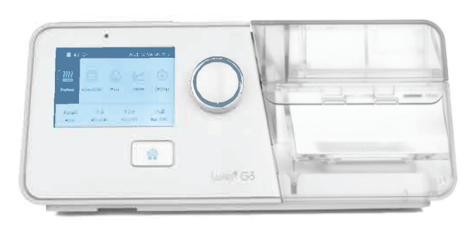
Luna G3 Bilevel 25A (LG3700) and Bilevel ST 30Vt (LG3800)